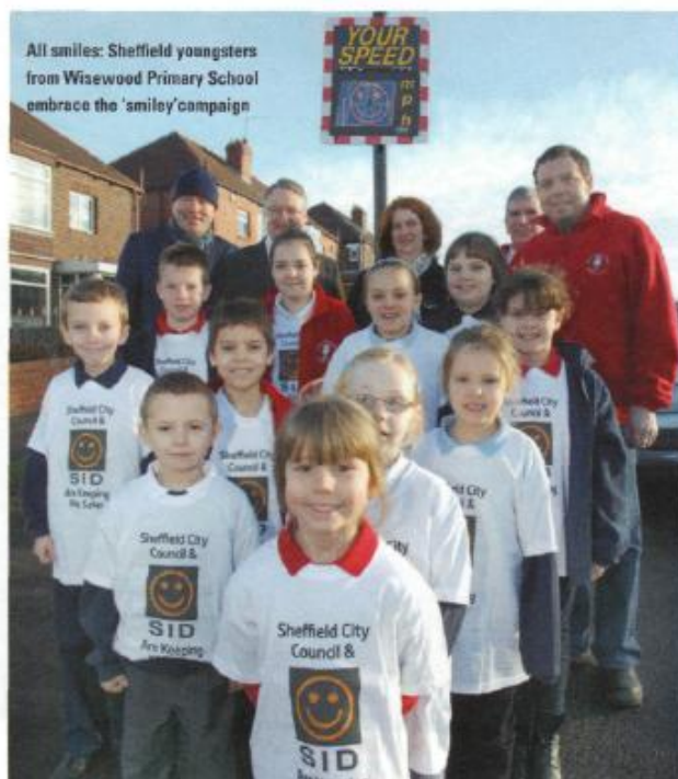
All smiles: Sheffield youngsters from Wisewood Primary School embrace the 'smiley' campaign

The council is working to move away from road humps, and use less traditional traffic-calming measures to address the legitimate concerns of the local community towards excessive or inappropriate speeding on